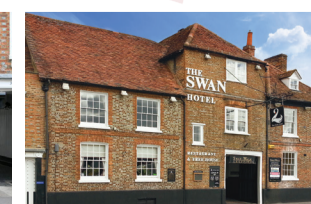
THE SWAN HOTEL